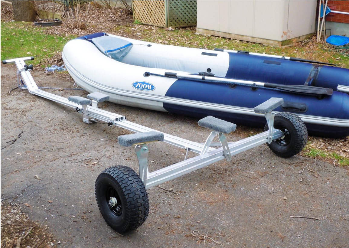
Dolly – Ready to Load