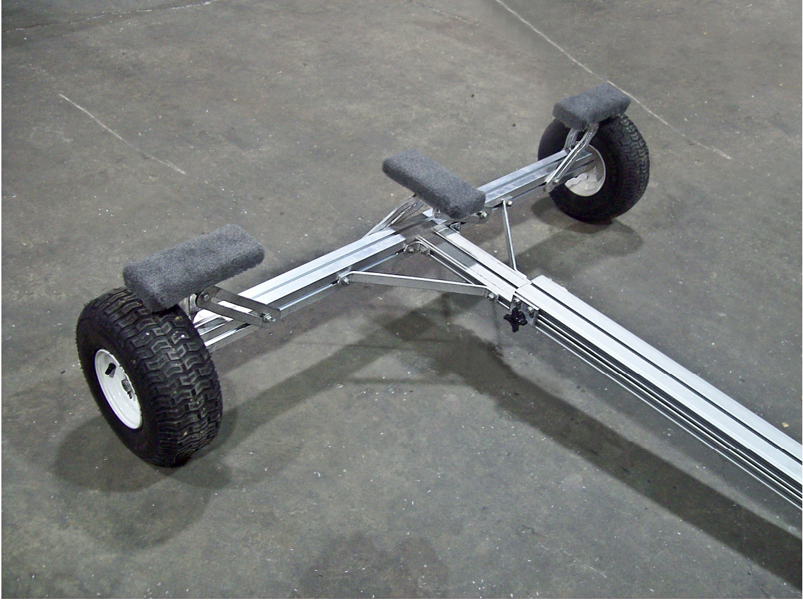
SUT-300-U Dolly - Installed Inflatable Kit